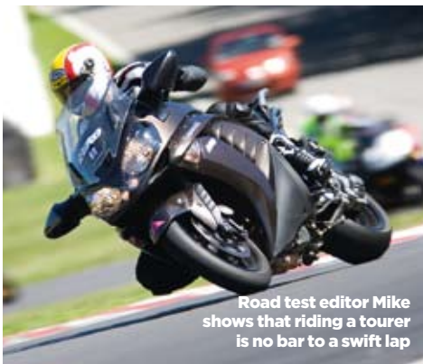
Road test editor Mike shows that riding a tourer is no bar to a swift lap

It's just before lunchtime at Brands Hatch, on a trackday with a difference. There's an unusual atmosphere. It's quiet – even though there are bikes out on the track. The peacefulness is thanks to the drone of road-legal exhausts replacing the piercing punch of race cans. The back of the garages is calm, too. No vans or trailers. No trailing leads and clutter. Today is about the bikes and their owners. We mingle, we socialise, and if someone has a problem, it's shared.