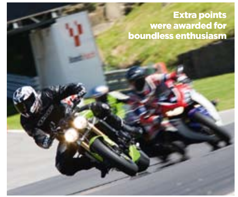
Extra points were awarded for boundless enthusiasm