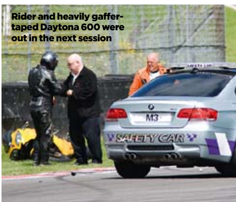
Rider and heavily gaffer-taped Daytona 600 were out in the next session

To those who made it to the day at Brands, thank you. To those booked on our Cadwell day on August 17, see you soon (details, p26).